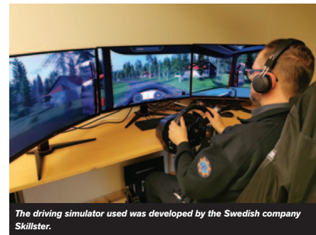
The driving simulator used was developed by the Swedish company Skillster.