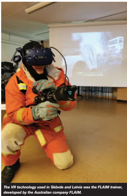
The VR technology used in Skövde and Latvia was the FLAIM trainer, developed by the Australian company FLAIM.